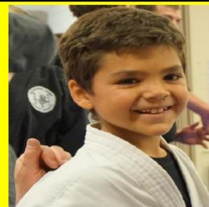
Doncaster / Templestowe Parents

Explode your child's CONFIDENCE with these FUN Karate classes