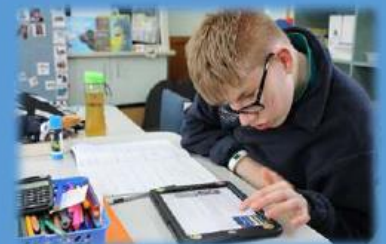
Special School, Special Students