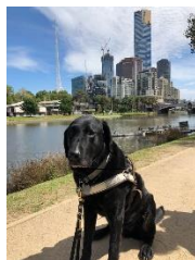
Grover in harness