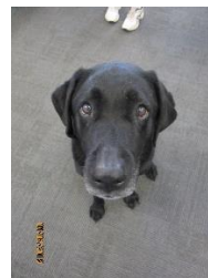
Grover, lovely manners