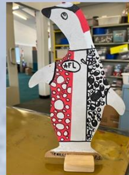
Eliza & Sienna 5/6F