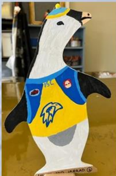
Shota & Jarrod 5/6S