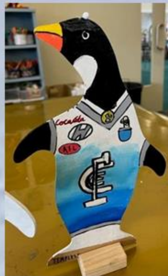
Camilla & Amelia 5/6A