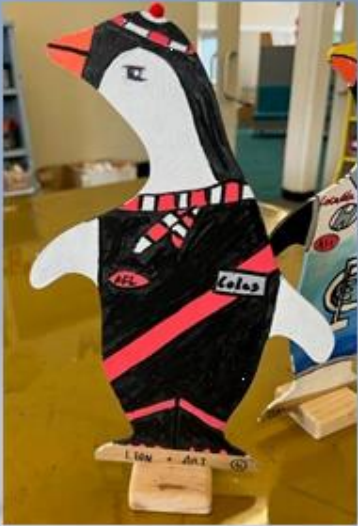
Leon & Ari 5/6K