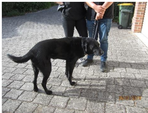
Out to breakfast