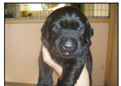
Baby pup Grover in the nursery, GDV