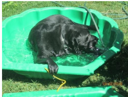
The hose stopped running, I can relax!