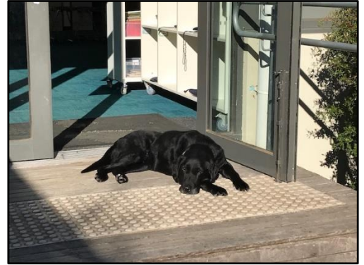
Lazing in the sun