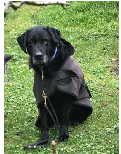
Winter holidays 2021