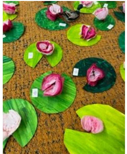
Grade 2 Monet's Waterlily Pond