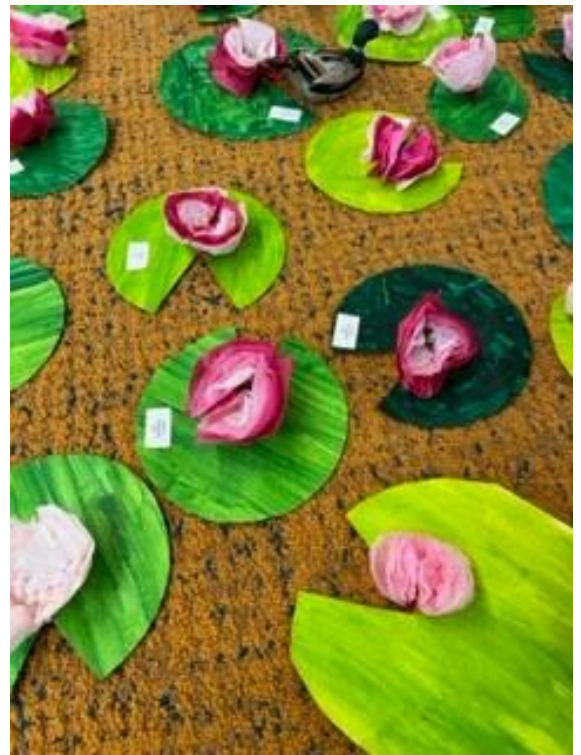
Grade 2 Monet's Waterlily Pond

And here's a sneak peek at something you might see.