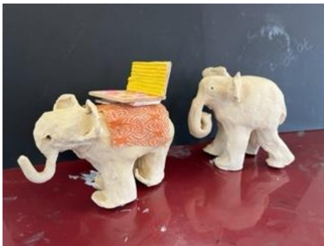
Luke 5MR Isabella 5KW