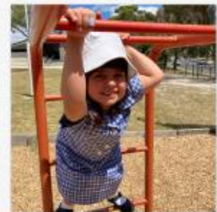
Outside play for our preps

We are so fortunate to have such friendly educators on board, and we can't wait to watch the service grow this year!