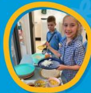
Taco Tuesday and DIY burrito bowl!

This week's theme at Theircare is our 'BAKE-OFF' week!