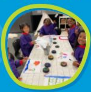
Water colour painting