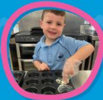
Carrot muffin baking fun!

We pay our respect to the Elders of the past, present and emerging and acknowledge their spiritual connection to Country.