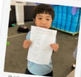
Our time capsule activity, where children write a letter to themselves and will receive it at the end of the year!