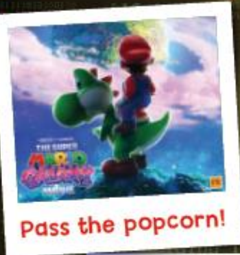
Pass the popcorn!