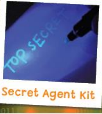
Secret Agent Kit